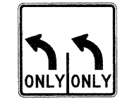
R3-8 (DL) (30"x30")

PLOT DATE = 11/13/2008 PLOT SCALE = AS SHOWN USER NAME = BUSER