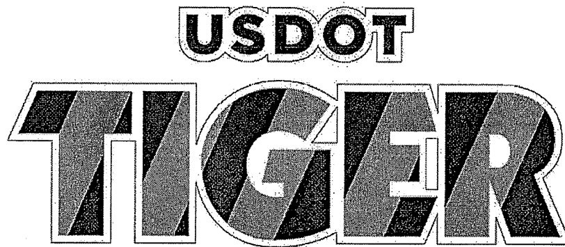
USDOT TIGER Vector-Based, Vinyl-Ready Pictograph

COLORS: OUTLINE - WHITE (RETROREFLECTIVE) USDOT LEGEND - BLACK TIGER DIAGONALS - BLACK, ORANGE (RETROREFLECTIVE)