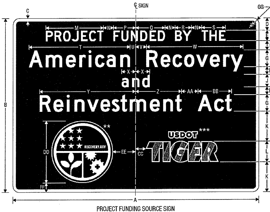
PROJECT FUNDING SOURCE SIGN

NOTE: SIGN SHALL NOT BE INSTALLED WITHOUT PROJECT FUNDING SOURCE PLAQUE