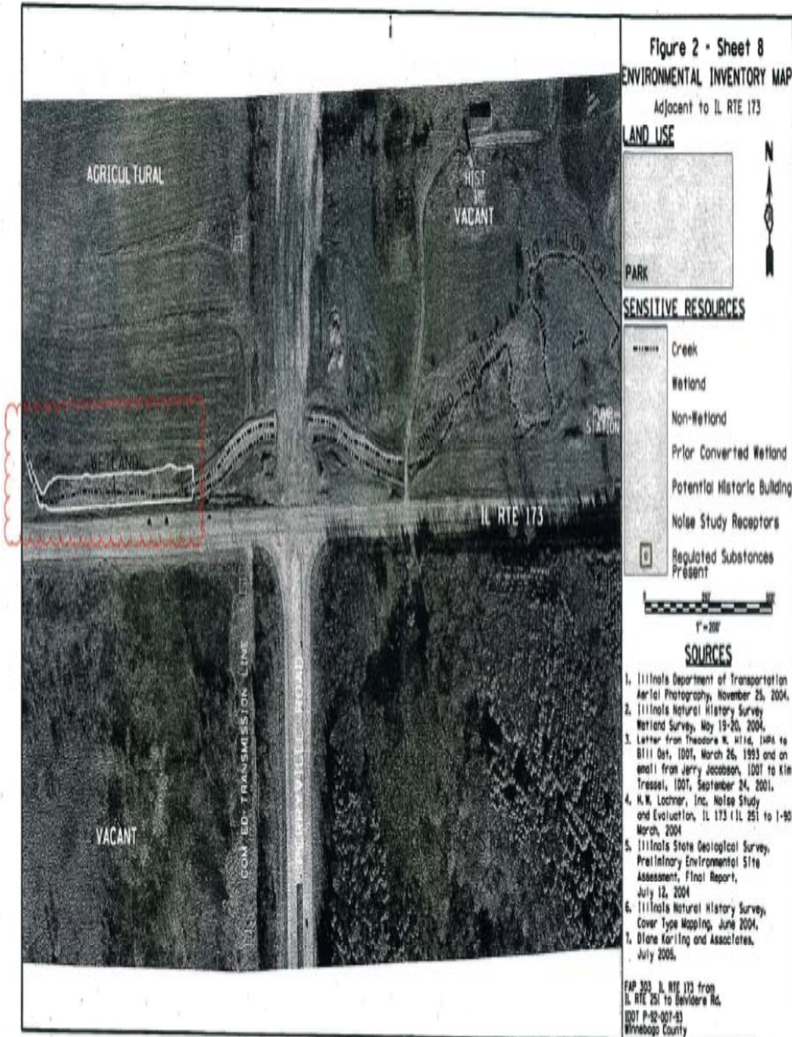
FIGURE 2 SHEET 8