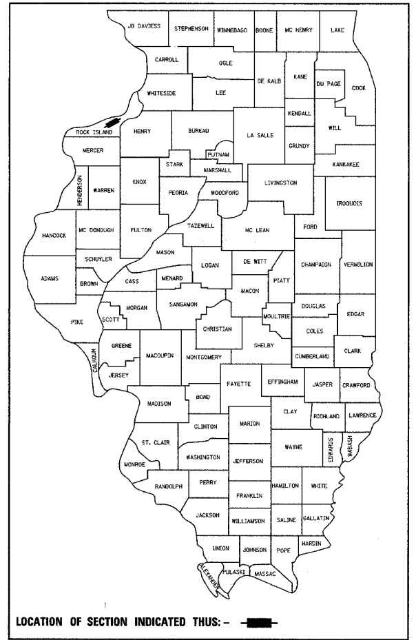
LOCATION OF SECTION INDICATED THUS: - ■ -