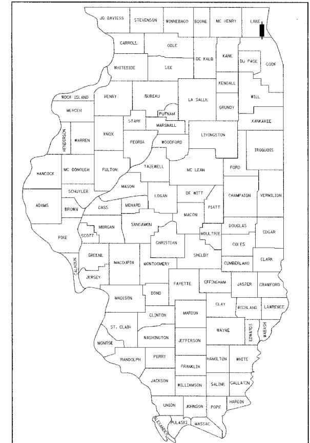
LOCATION OF SECTION INDICATED THUS: — ■ —

FAU ROUTE 2666 (BUFFALO GROVE ROAD) OVER INDIAN CREEK BRIDGE REHABILITATION RECONSTRUCTION: NORTH AND SOUTH OF INDIAN CREEK SECTION 00-00254-01-BR PROJECT ACBHM-8003(213) VILLAGE OF VERNON HILLS AND VILLAGE OF BUFFALO GROVE LAKE COUNTY JOB NO. C-91-258-02