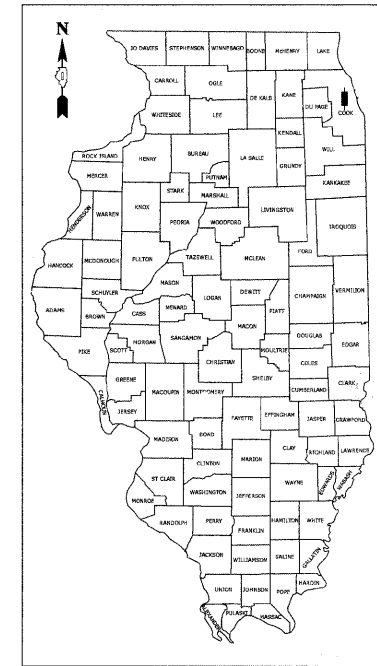
LOCATION OF SECTION INDICATED THUS:

TRAFFIC DATA ADT (2010) = 3,500 POSTED SPEED LIMIT = 20 MPH DESIGN SPEED LIMIT = 25 MPH