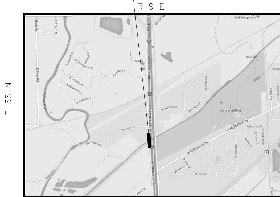
TROY TOWNSHIP MAP 1

LOCATION 1: SN 099-0036 I- 55 WEST FRNT RD OVER I & M CANAL VILLAGE OF CHANNAHON