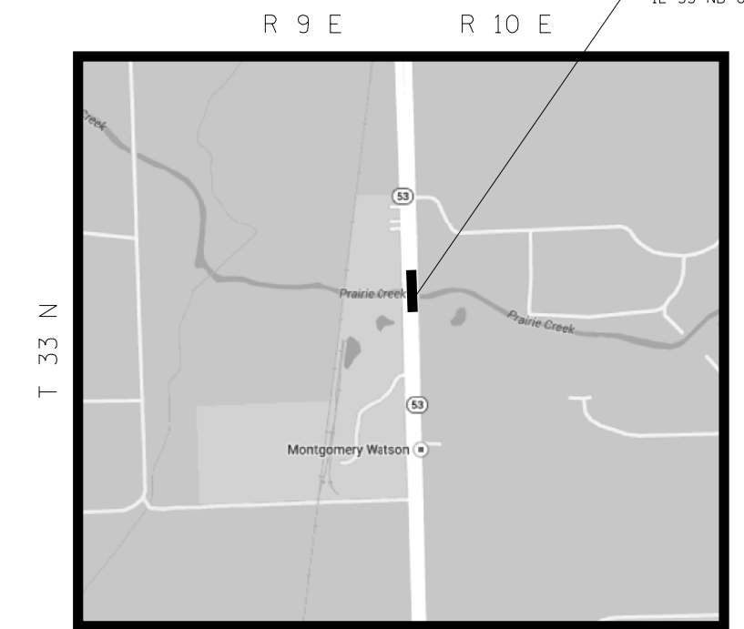
FLORENCE TOWNSHIP MAP 4

LOCATION 5: SN 099-0090 IL 53 NB OVER PRAIRIE CREEK