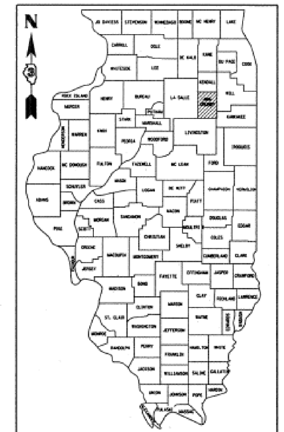
LOCATION OF SECTION INDICATED THUS: [arrow pointing to shaded area]

PROJECT LOCATION THREE RIVERS REST AREA FAI 80 WESTBOUND