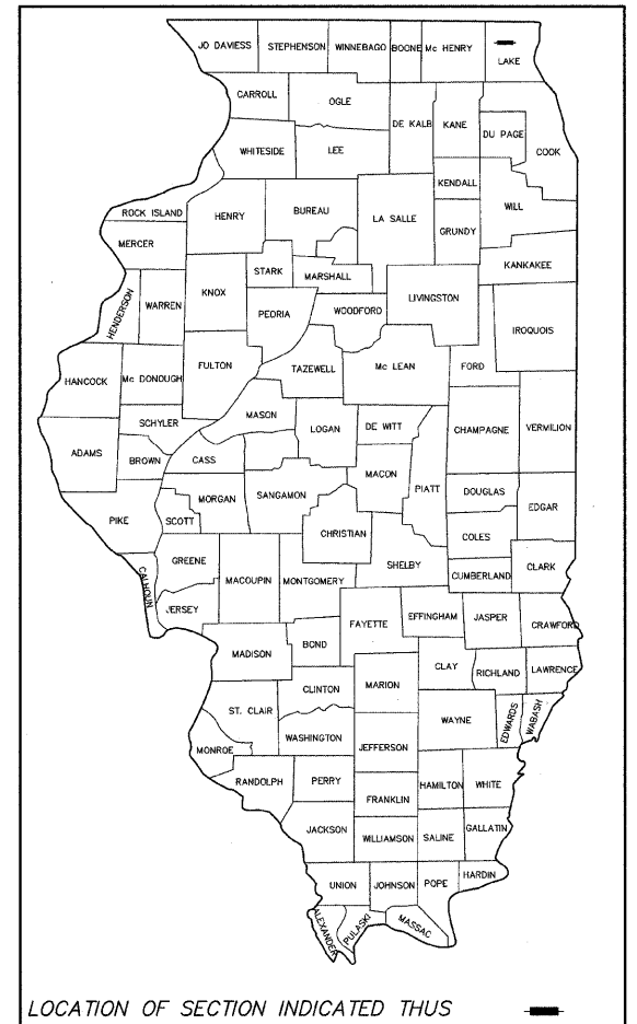
LOCATION OF SECTION INDICATED THUS