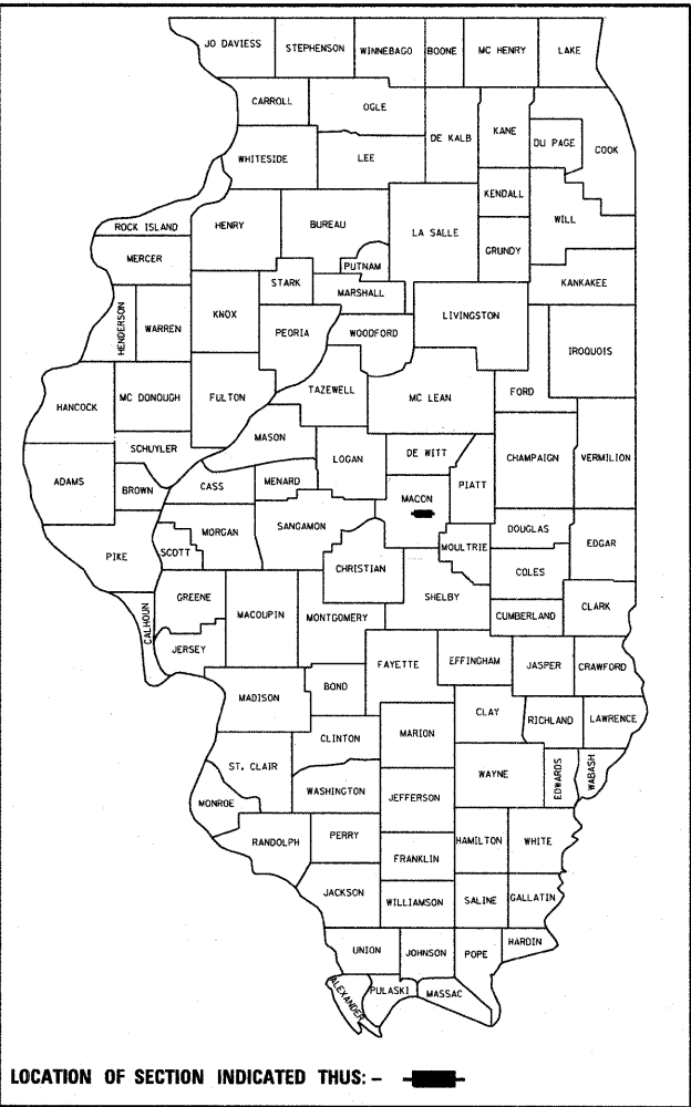
LOCATION OF SECTION INDICATED THUS: - [black rectangle] -