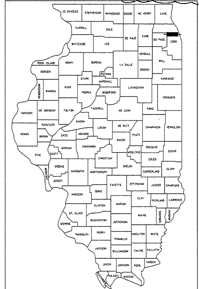
LOCATION OF SECTION INDICATED THUS: - [black rectangle]

ILLINOIS CONTRACT NO. 60P35 * 537 + 1 = 538 D-91-518-11 * 538 + 3 = 541