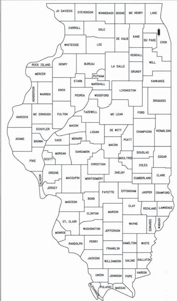
LOCATION OF SECTION INDICATED THUS: - [black rectangle]

ROUTE: IL ROUTE 45/US ROUTE 12 (MANNHEIM ROAD) SECTION: AT HIGGINS ROAD & AT LAWRENCE AVENUE PROJECT NO.: JOB NO.: R-90-026-11 COUNTY: COOK COUNTY LIMITS: MANNHEIM ROAD - 174+99.00 TO 193+90.23 LAWRENCE ROAD - 12+33.72 TO 15+94.26