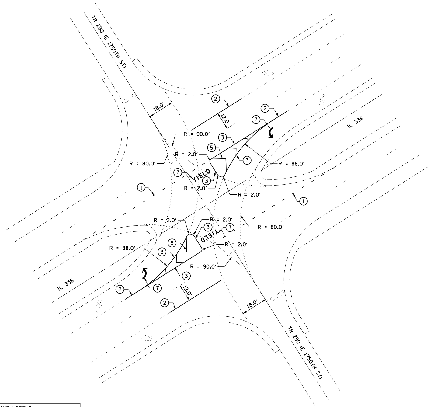
IL 336 & TR 290 /E 1750TH ST PLAN VIEW