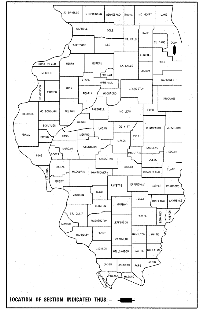
LOCATION OF SECTION INDICATED THUS: - [black rectangle] -