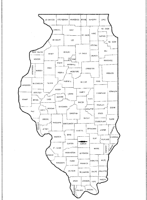
LOCATION OF PROJECT INDICATED THUS - -