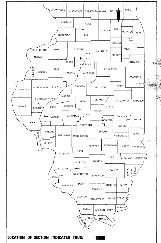
LOCATION OF SECTION INDICATED THUS: - [black bar] -

PROJECT LOCATION: WALKUP ROAD FROM LIVE OAK ROAD TO CRYSTAL SPRINGS ROAD PAVEMENT WIDENING AND RESURFACING, TRAFFIC SIGNAL MODERNIZATION AND SHARED USE PATH CONSTRUCTION CITY OF CRYSTAL LAKE AND VILLAGE OF BULL VALLEY MCHENRY COUNTY C-91-374-00