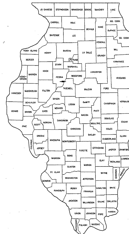
LOCATION OF PROPOSED IMPROVEMENT

PROJECT NO. HD-ARA-00D4 (103) SECTION NO. 09-00066-01-SW JOB NO. C-94-032-10 CATALOG NO. 034352-00D