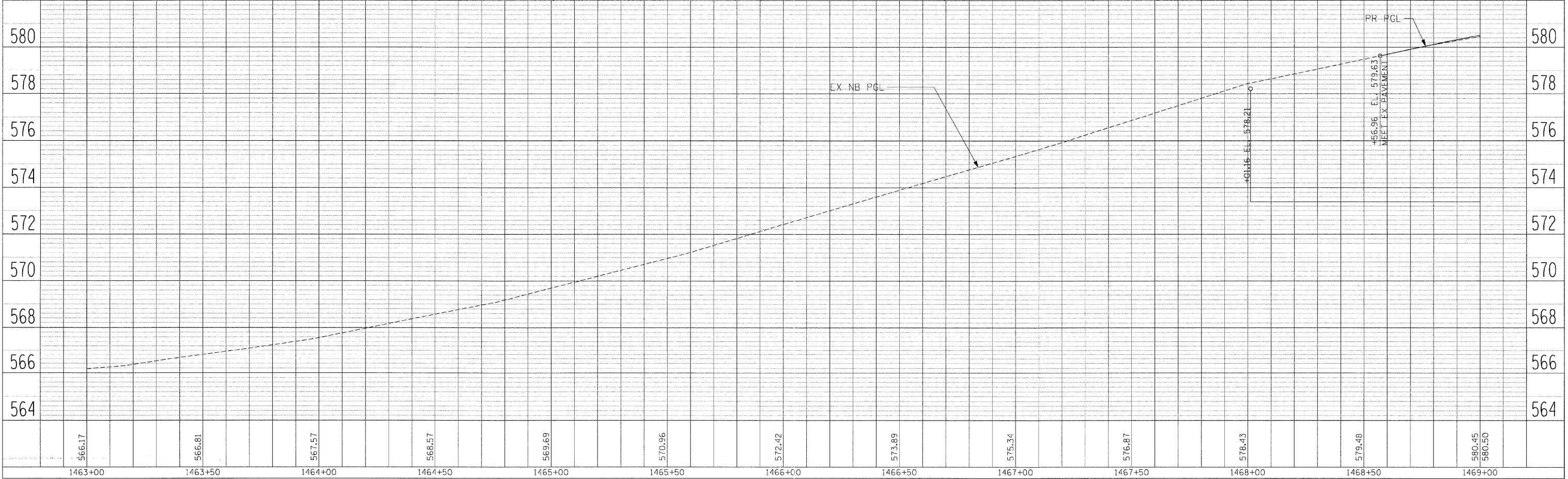
NORTHBOUND IL RTE 92 PLAN & PROFILE STA 1463+00 TO STA 1469+00