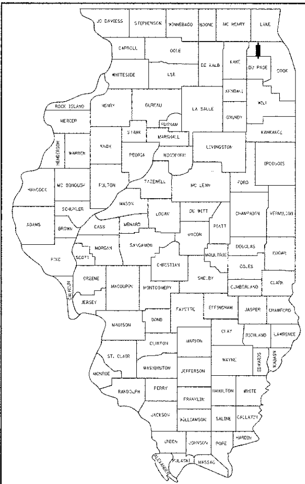
LOCATION OF SECTION INDICATED THIS: - [shaded area] -

STATE OF ILLINOIS DEPARTMENT OF TRANSPORTATION DIVISION OF HIGHWAYS