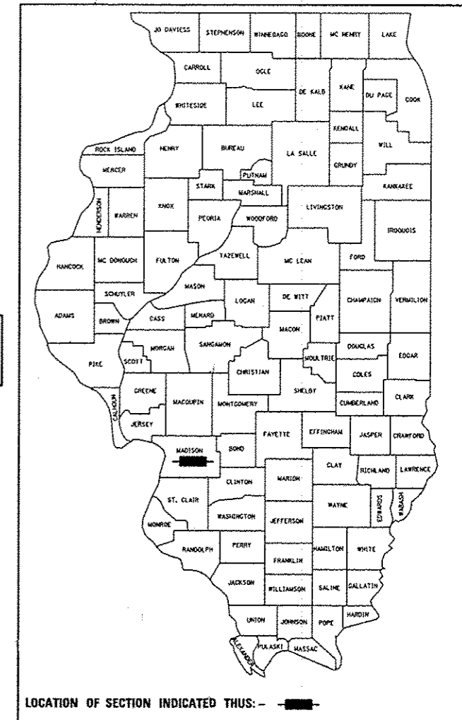
LOCATION OF SECTION INDICATED THUS: [Symbol]