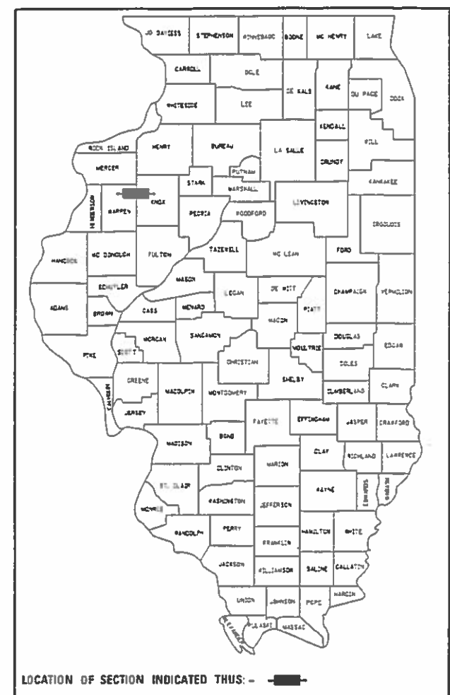
LOCATION OF SECTION INDICATED THUS: - [shaded box] -

Sta. Equa. 712 + 50 (BK) = 710 + 00 (AH) EB Sta. Equa. 898 + 97.33 (BK) = 330 + 50 (AH) WB Sta. Equa. 897 + 98.26 (BK) = 330 + 50 (AH) Sta. Equa. 343 + 65 (BK) = 344 + 67 (AH)