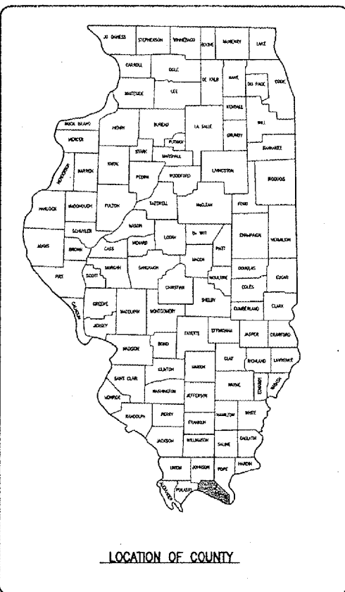
LOCATION OF COUNTY

ILL. PROJ.: M30-3540 A.I.P. PROJ.: 3-17-0067-B7