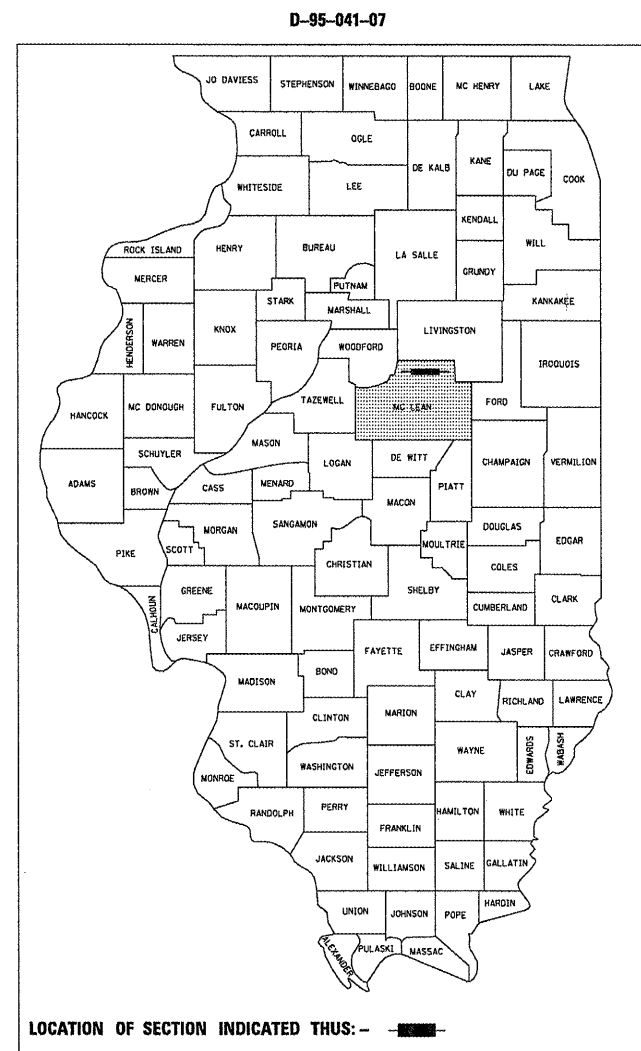
LOCATION OF SECTION INDICATED THUS: - [shaded rectangle] -