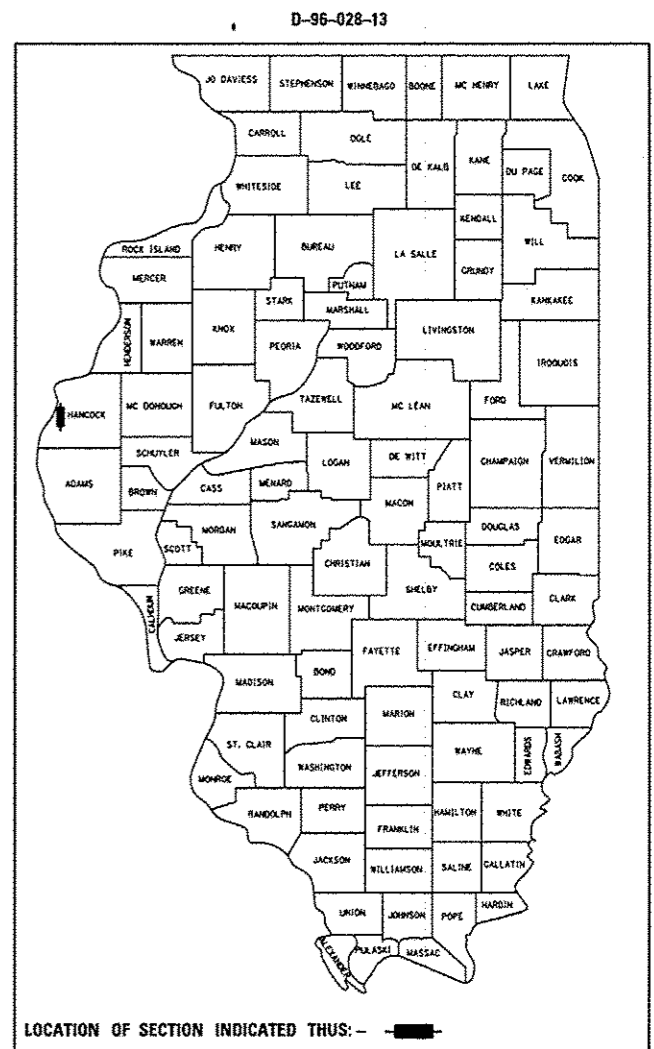
LOCATION OF SECTION INDICATED THUS: - [black rectangle] -

END PROJECT STA. 274+87.16 GROSS LENGTH = 1056.00 FT. = 0.20 MILE NET LENGTH = 1056.00 FT. = 0.20 MILE