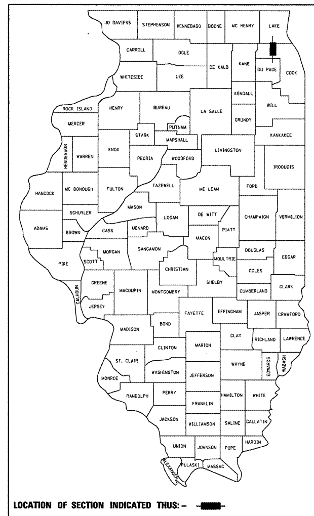
LOCATION OF SECTION INDICATED THIS: - [shaded rectangle] -