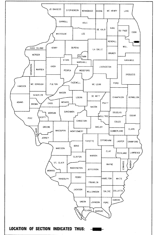
LOCATION OF SECTION INDICATED THIS: [Symbol]