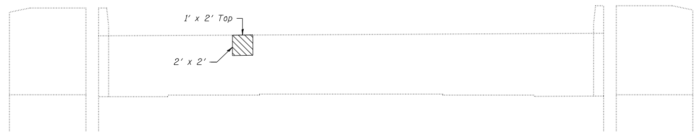
ABUTMENT ELEVATION (North Abutment SN 001-0055)