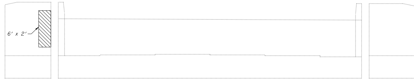
ABUTMENT ELEVATION (South Abutment SN 001-0056)