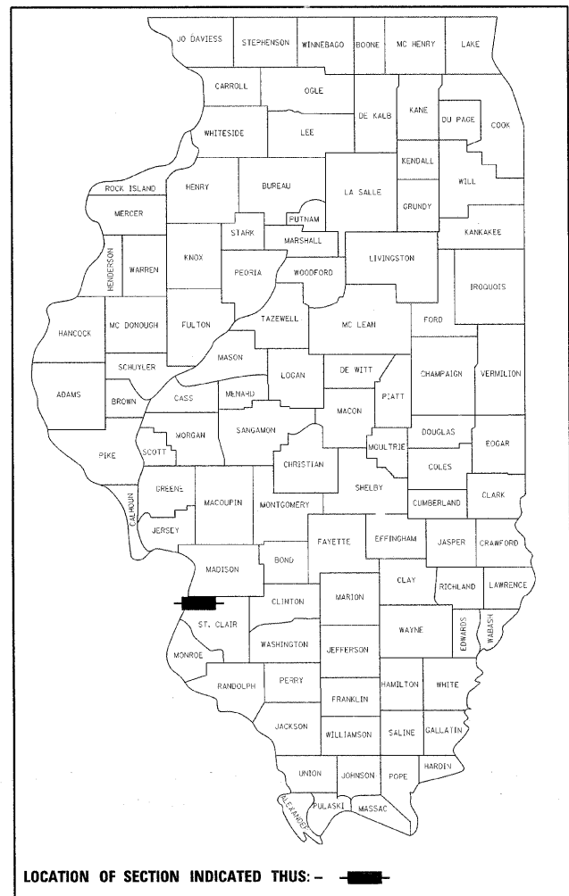
LOCATION OF SECTION INDICATED THUS: - ■ -