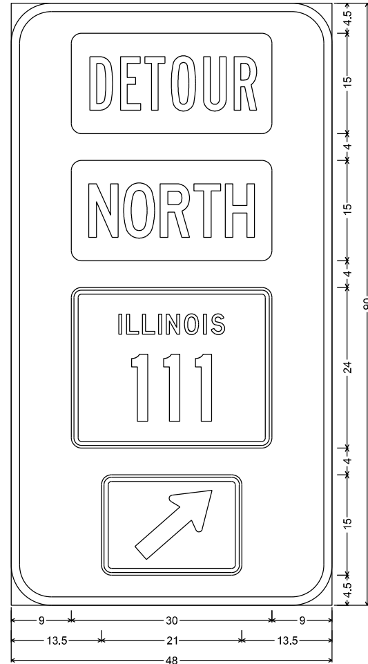
6.0" Radius, 1.3" Border, Black on Orange; M4-8; M3-1; M6-2R;