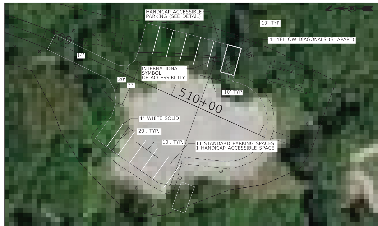
COTTAGE ACCESS ROAD