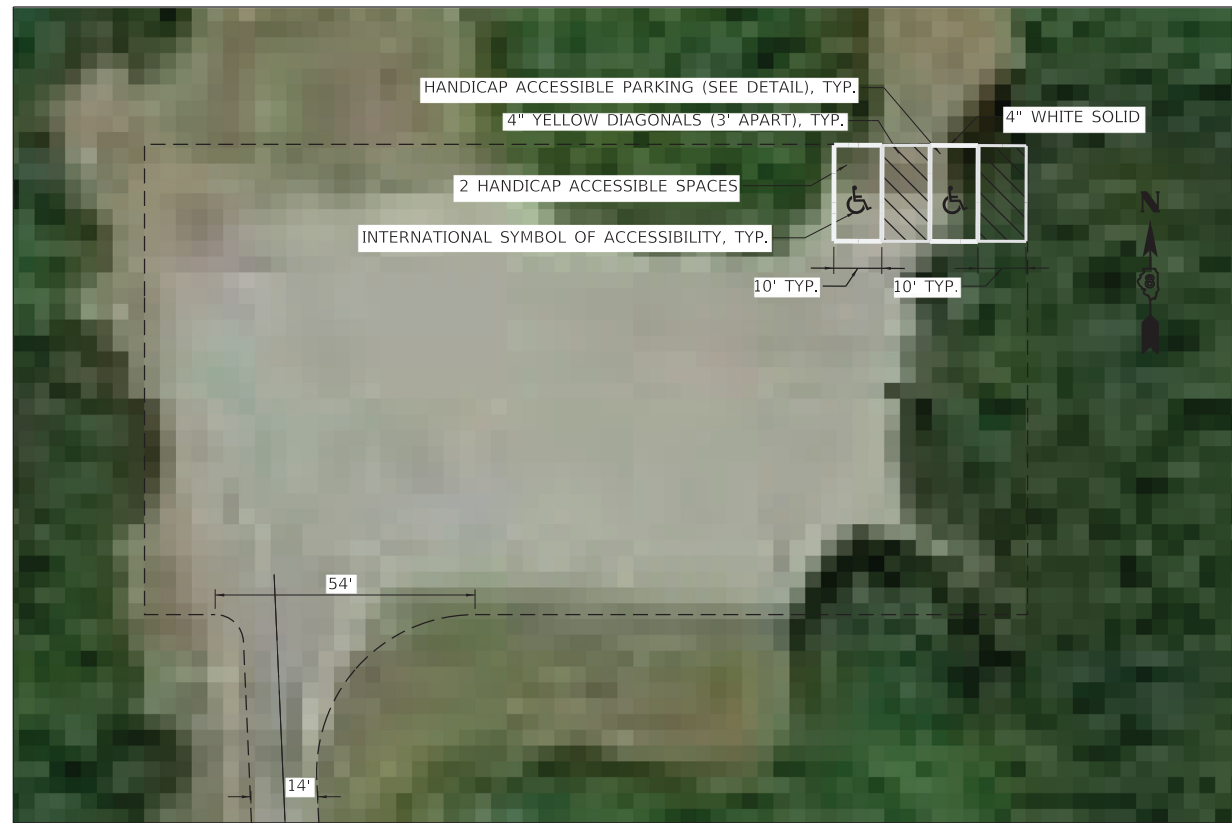
YOUTH CAMP ROAD