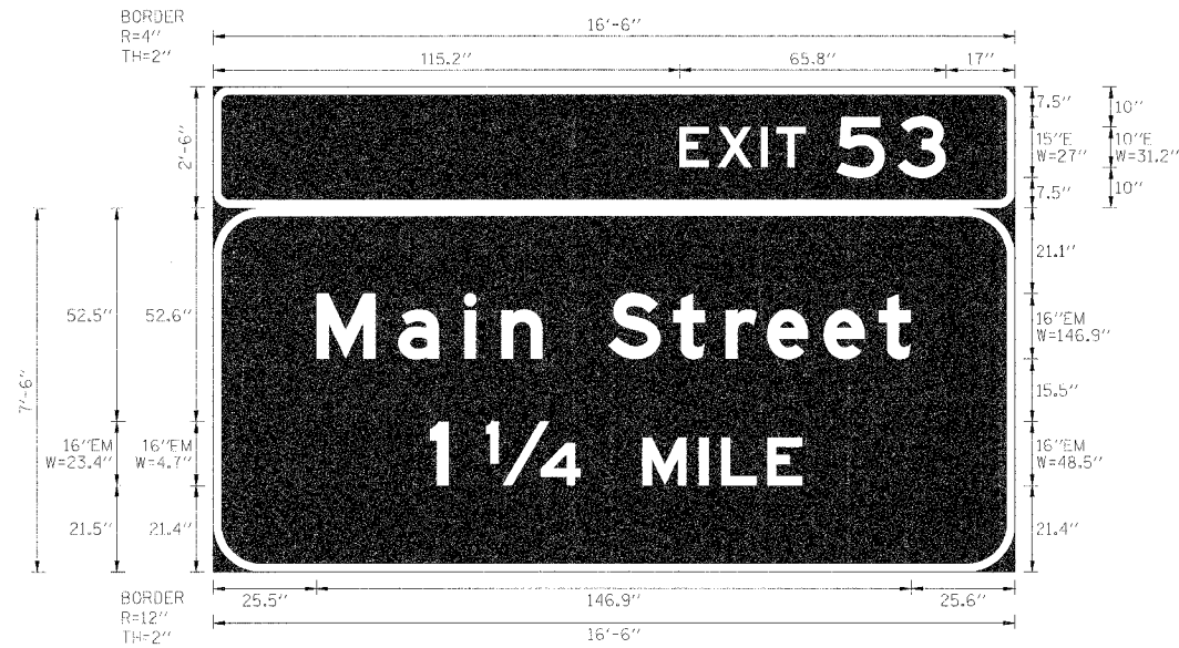
SIGN NO. 6 SOUTHBOUND I-57 (STA. 403+52.04 OVERHEAD SIGN)