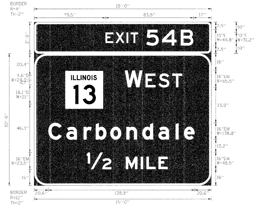
SIGN NO. 5 SOUTHBOUND I-57 (STA. 375+00 49.21' RT.)