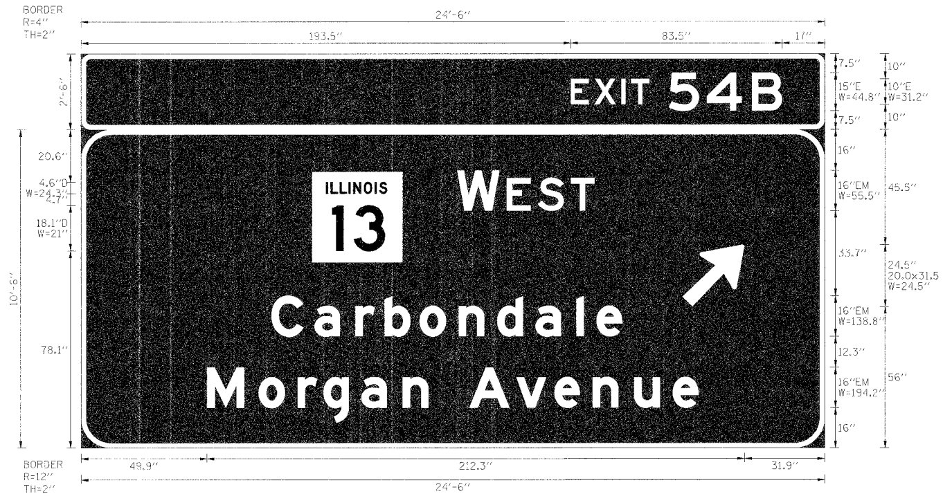
SIGN NO. 8 SOUTHBOUND I-57 (STA. 403+52.04 OVERHEAD SIGN)