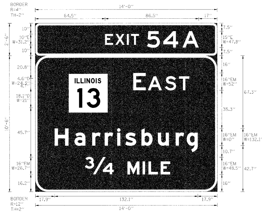
SIGN NO. 7 SOUTHBOUND I-57 (STA. 403+52.04 OVERHEAD SIGN)