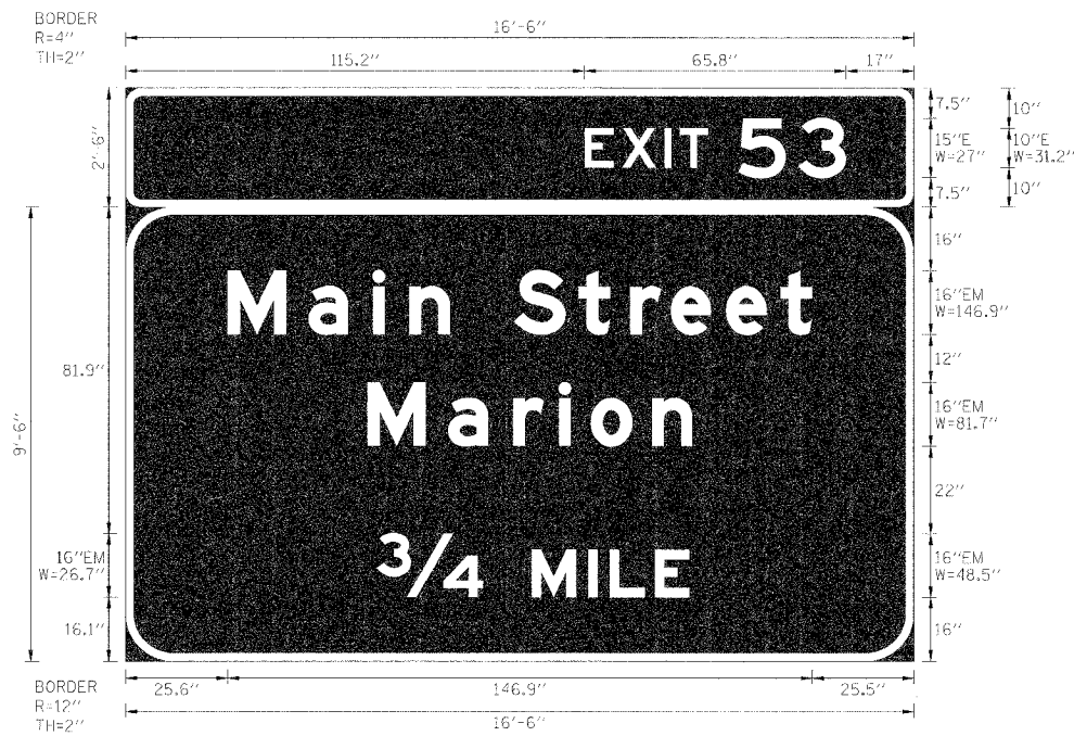
SIGN NO. 12 SOUTHBOUND I-57 AND MORGAN AVENUE BRIDGE (STA. 1475+16.96 BRIDGE MOUNTED SIGN)