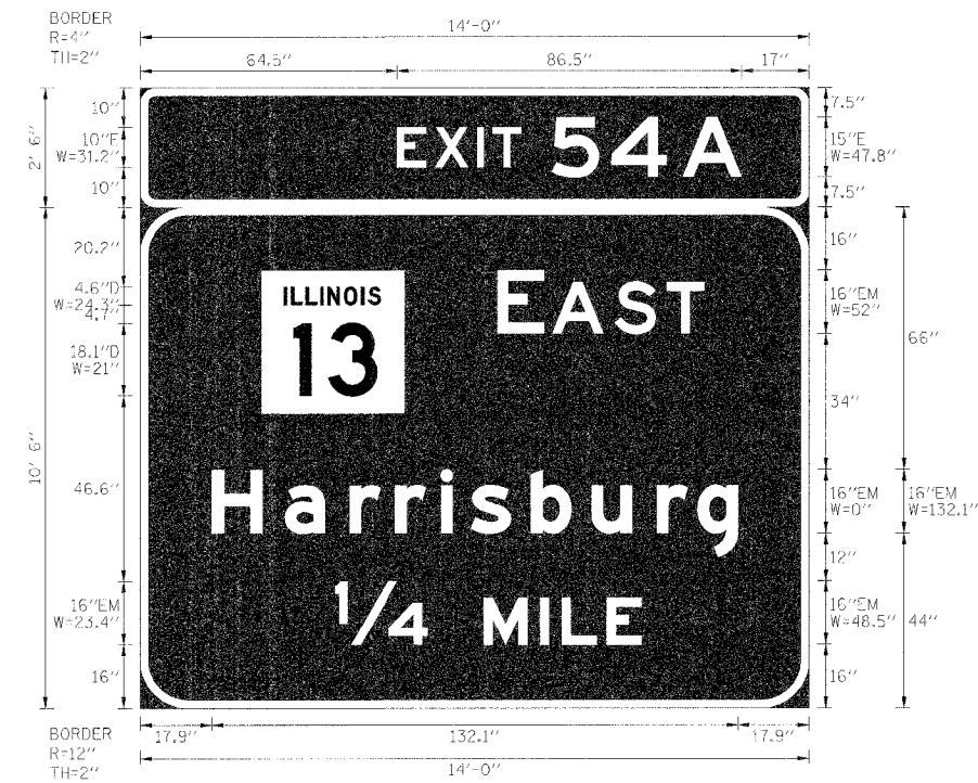
SIGN NO. 13 SOUTHBOUND I-57 AND MORGAN AVENUE BRIDGE (STA. 1475+16.96 BRIDGE MOUNTED SIGN)