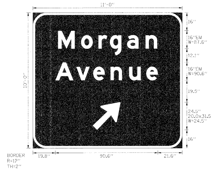
SIGN NO. 11 SOUTHBOUND RAMP 'H' (STA. 417+15.26 OVERHEAD SIGN)