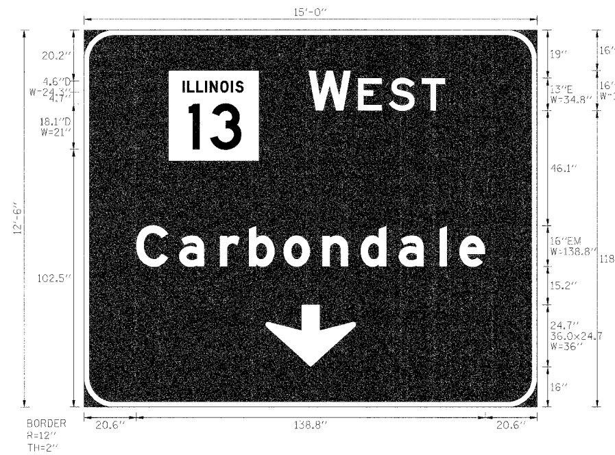
SIGN NO. 10 SOUTHBOUND RAMP 'H' (STA. 417+15.26 OVERHEAD SIGN)