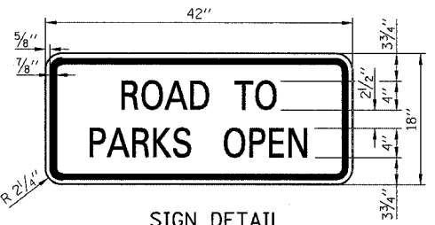
SIGN DETAIL SIGN PANEL - TYPE 1