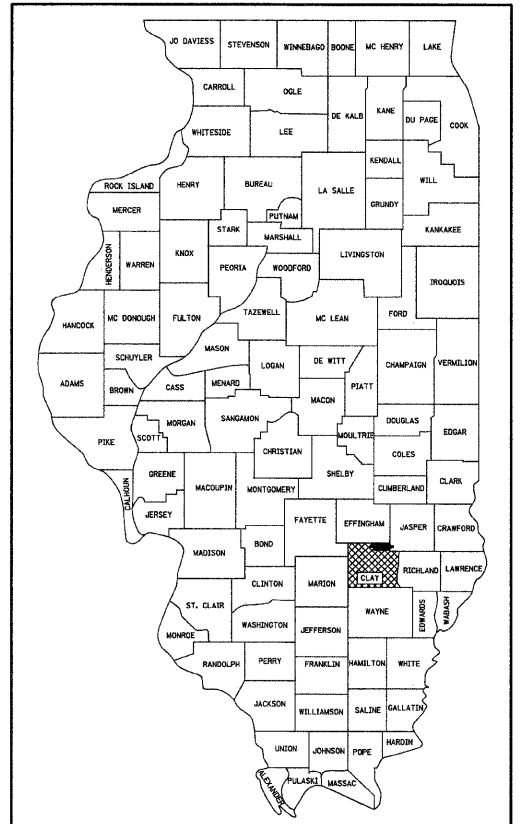
LOCATION OF SECTION INDICATED THUS: - ■ -