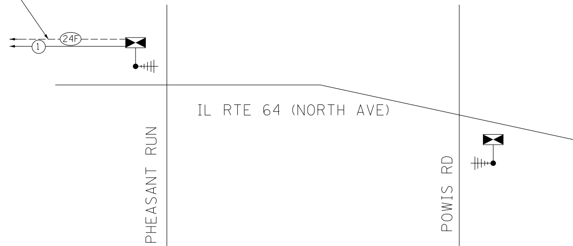
TEMPORARY RADIO INTERCONNECT SCHEMATIC

EXISTING FIBER OPTIC INTERCONNECT TO SMITH / KAUTZ ROAD