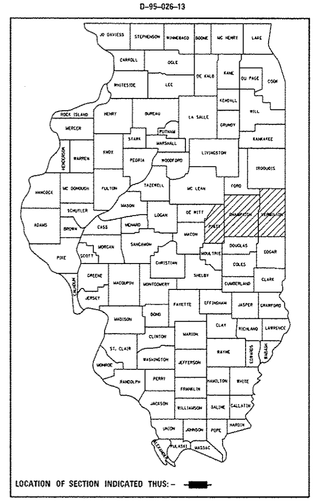
LOCATION OF SECTION INDICATED THUS: - [shaded box] -

GROSS LENGTH = 320,856.20 FT. = 60.769 MILE NET LENGTH = 320,856.20 FT. = 60.769 MILE