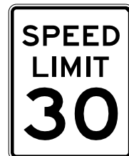
R2-1 24" X 30" H