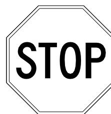
R1-1 30" X 30" J