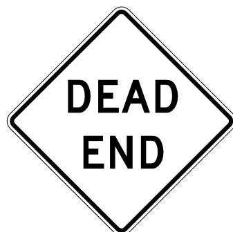
W14-1 36" X 36" P