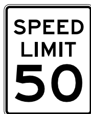
R2-1 24" X 30" H2