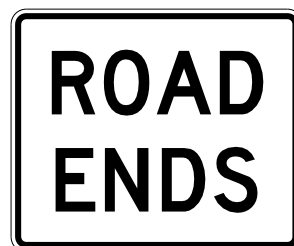
R11-I100 30" X 36" N