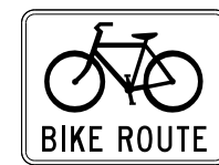
D11-1 24" X 18" E