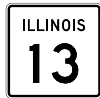
M1-I100 24" X 24" A