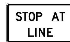
R10-I100 30" X 18" K