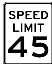
R2-1 24" X 30" H1