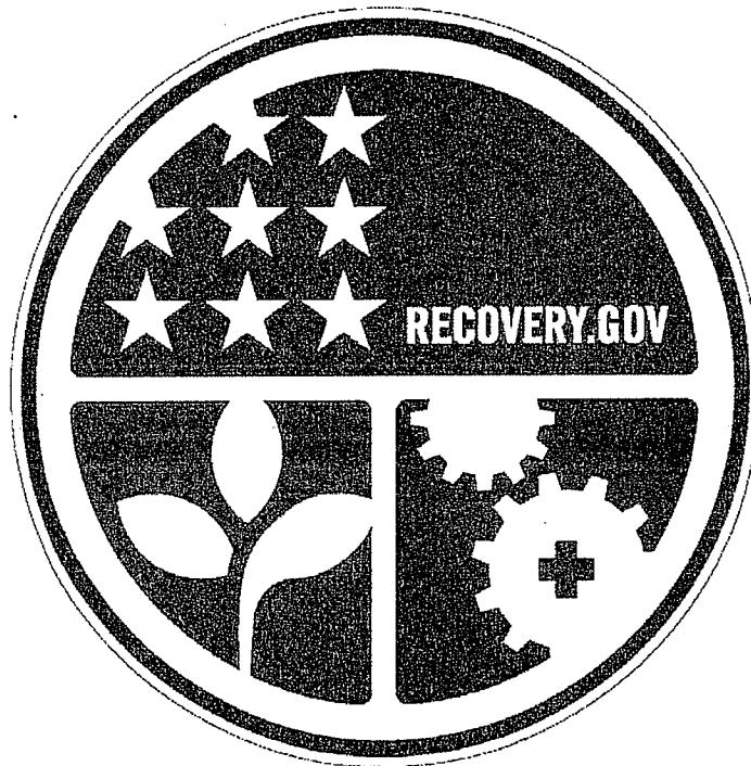
RECOVERY Vector-Based, Vinyl-Ready Pictograph

COLORS: LEGEND, OUTLINE - WHITE (RETROREFLECTIVE) BORDER - BLUE (RETROREFLECTIVE) BACKGROUND (UPPER) - BLUE (RETROREFLECTIVE) BACKGROUND (LOWER RIGHT) - RED (RETROREFLECTIVE) BACKGROUND (LOWER LEFT) - GREEN (RETROREFLECTIVE)