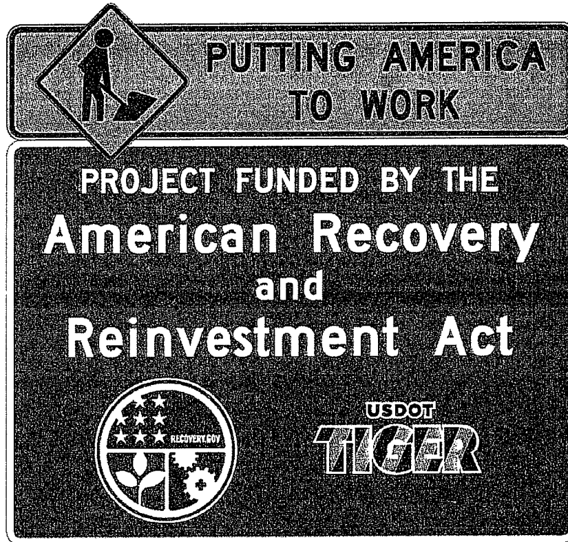
PROJECT FUNDING SOURCE SIGN ASSEMBLY