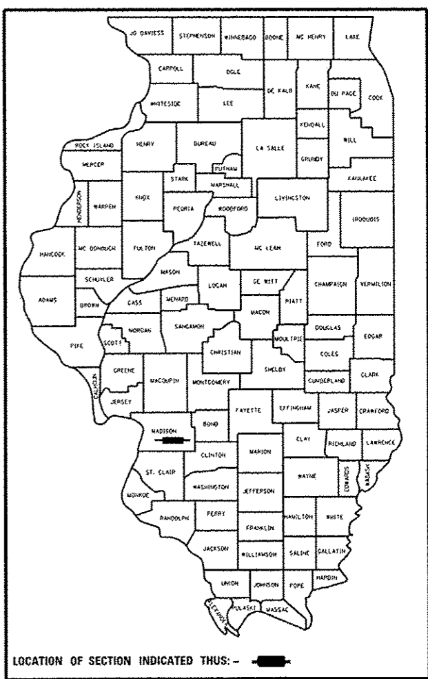
LOCATION OF SECTION INDICATED THUS: - - D-98-004-12

PROJECT END STA 1588+00 N 38° 47'04.14" W 89° 42'40.81"