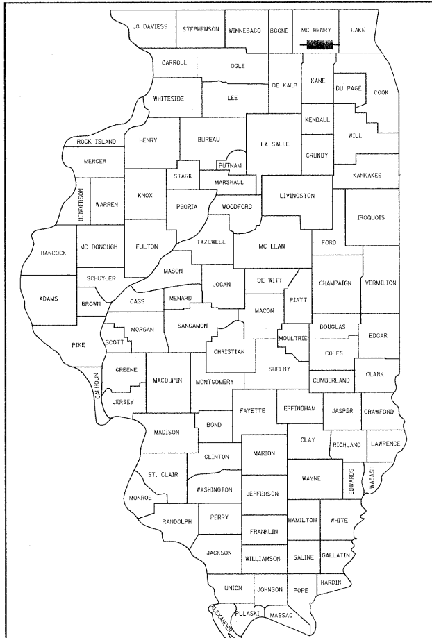
LOCATION OF SECTION INDICATED THUS: - [highlighted area] -