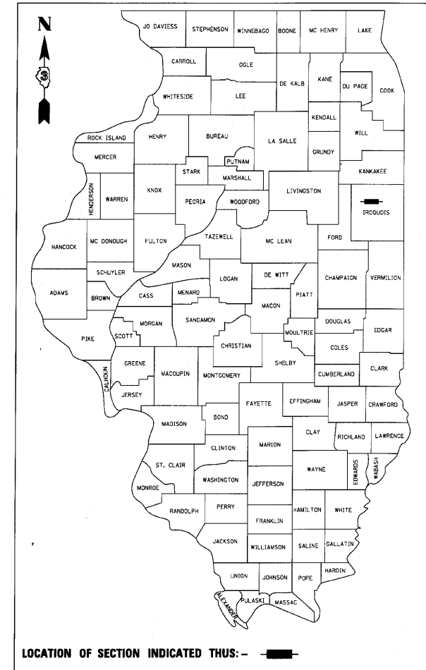
LOCATION OF SECTION INDICATED THUS: - [highlighted area] -