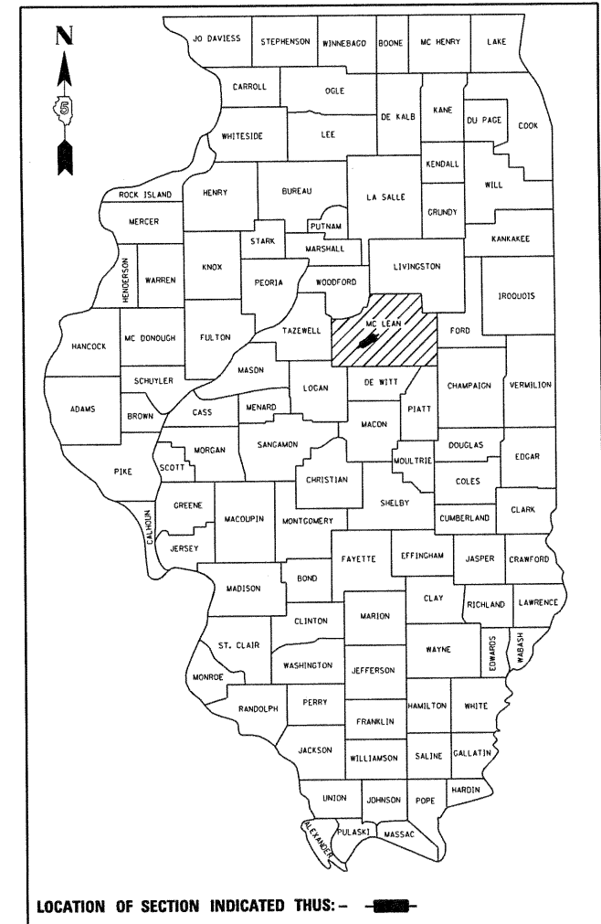
LOCATION OF SECTION INDICATED THUS: — ■ —

NET LENGTH = 5,146.44 FEET = 0.975 MILES