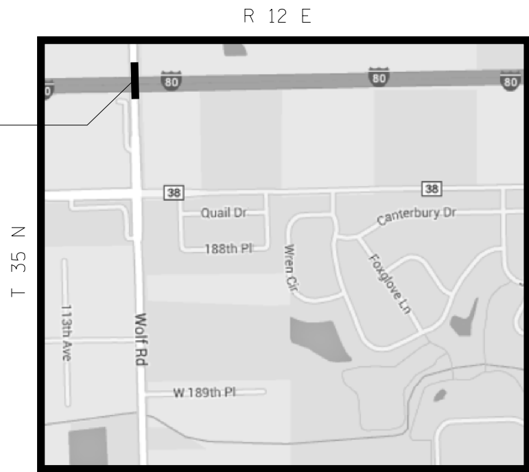
FRANKFORT TOWNSHIP MAP 13

LOCATION 18: SN 099-0192 WOLF RD OVER I- 80