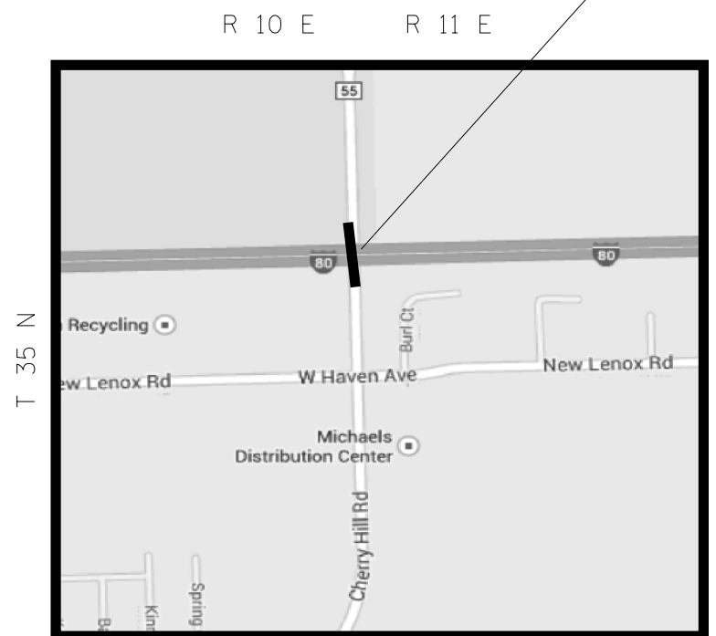
NEW LENOX TOWNSHIP MAP 16

LOCATION 21: SN 099-0198 MAPLE RD OVER I-80