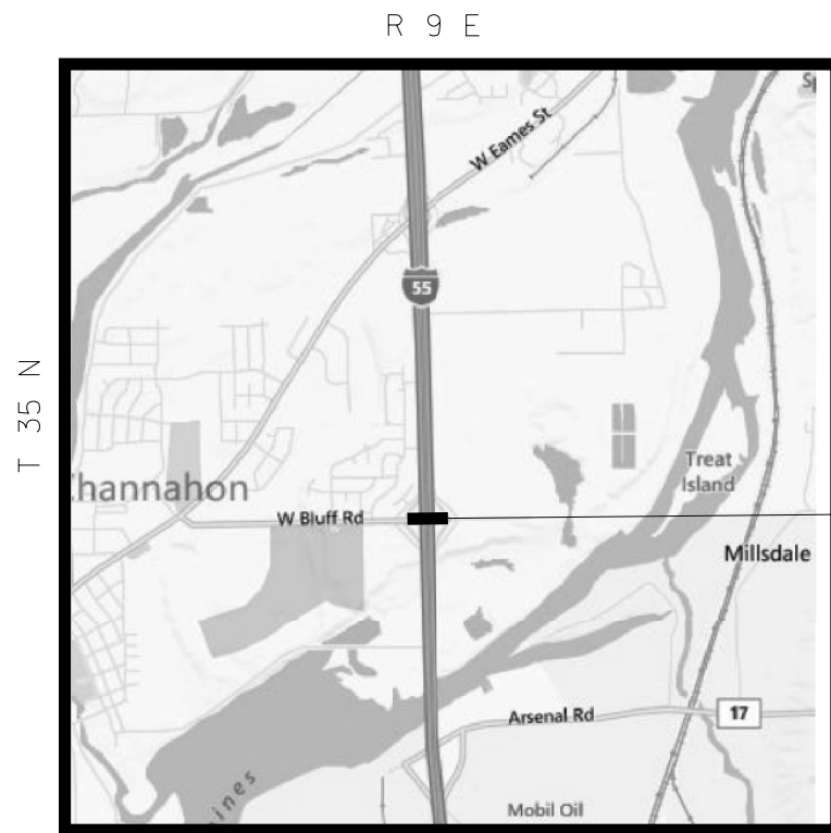
CHANNAHON TOWNSHIP MAP 17

LOCATION 23: SN 099-0208 BLUFF ROAD OVER I-55