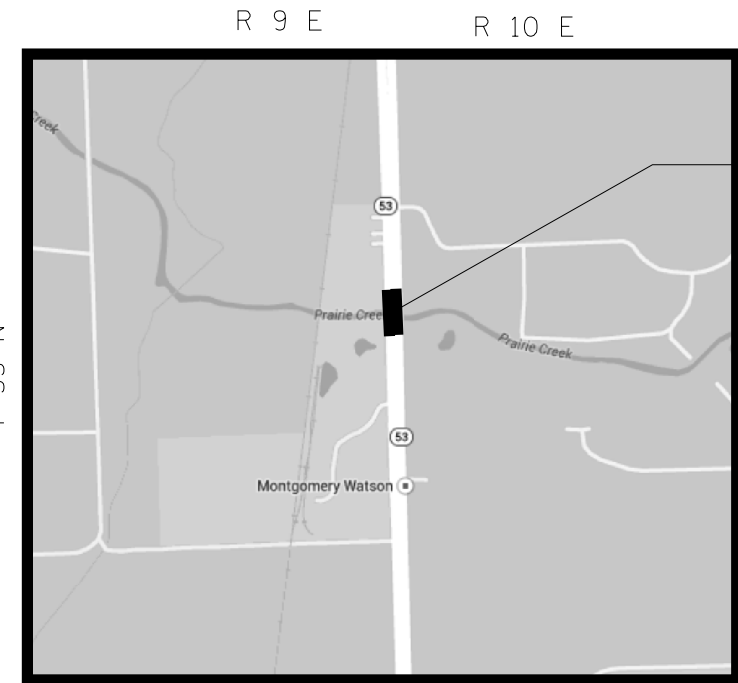
FLORENCE TOWNSHIP MAP 18

LOCATION 23: SN 099-0208 BLUFF ROAD OVER I-55