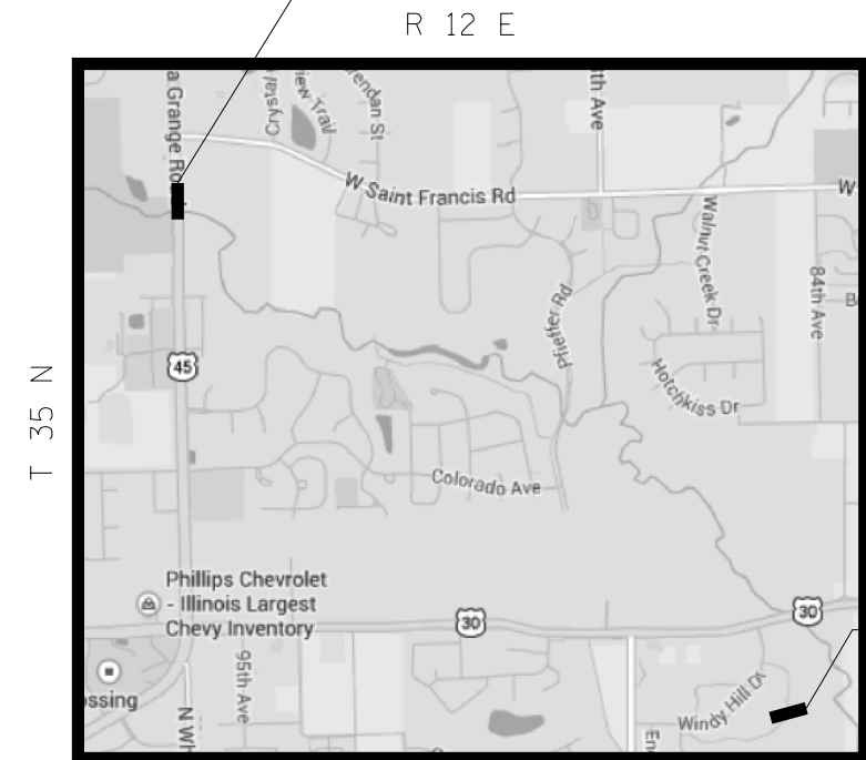
FRANKFORT TOWNSHIP MAP 20

LOCATION 25: SN 099-0271 WOLF RD OVER HICKORY CREEK CITY OF MOKENA