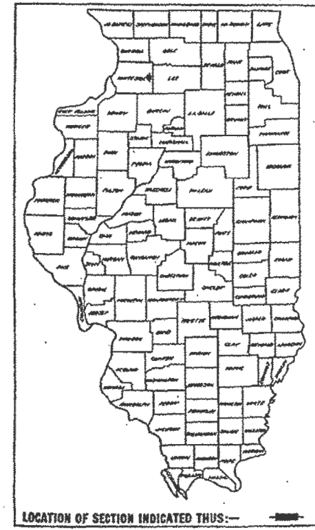
LOCATION OF SECTION INDICATED THUS: —