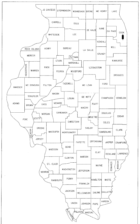
LOCATION OF SECTION INDICATED THIS: - [Black Box] -