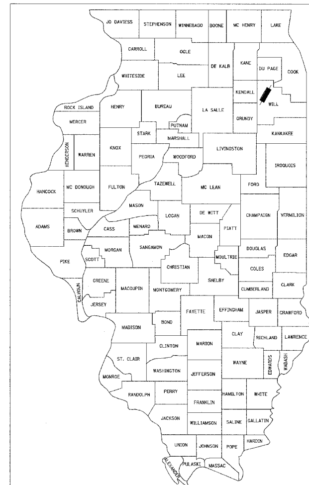
LOCATION OF SECTION INDICATED THUS: - [black box] -