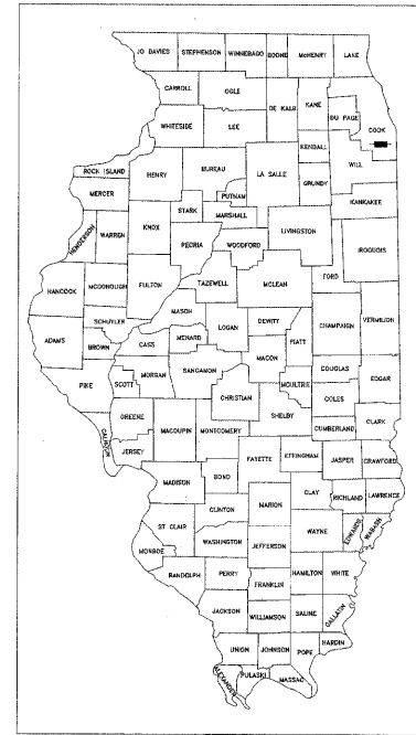
LOCATION OF SECTION INDICATED THUS: