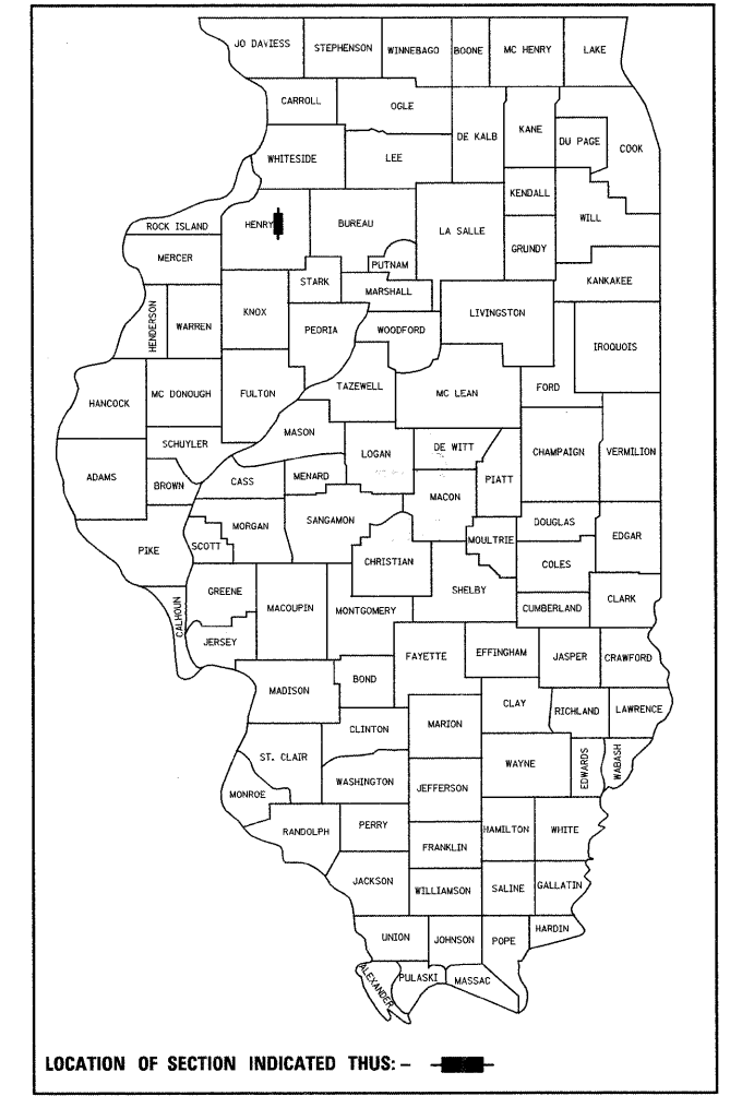
LOCATION OF SECTION INDICATED THUS: - [black rectangle] -